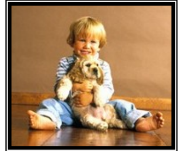
Dogs and Children need constant supervision and guidance to live together happily every after!

and play rough. In addition, children love to hug dogs. Unfortunately in doggie language this is a sign of dominance and if the dog resents such a gesture they may become aggressive. It is up to the adults in the household to teach kids boundaries with regards to pets & to help children see them as cherished family members to ensure a safe and respectful bond develops between the two. Pets and Children should be supervised at all times.